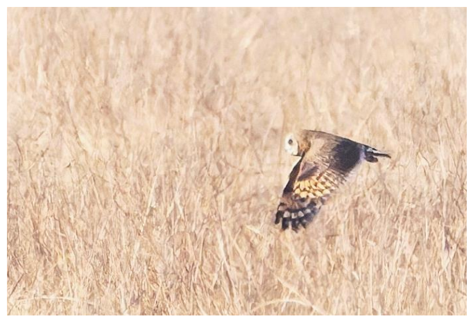
Marsh Owl