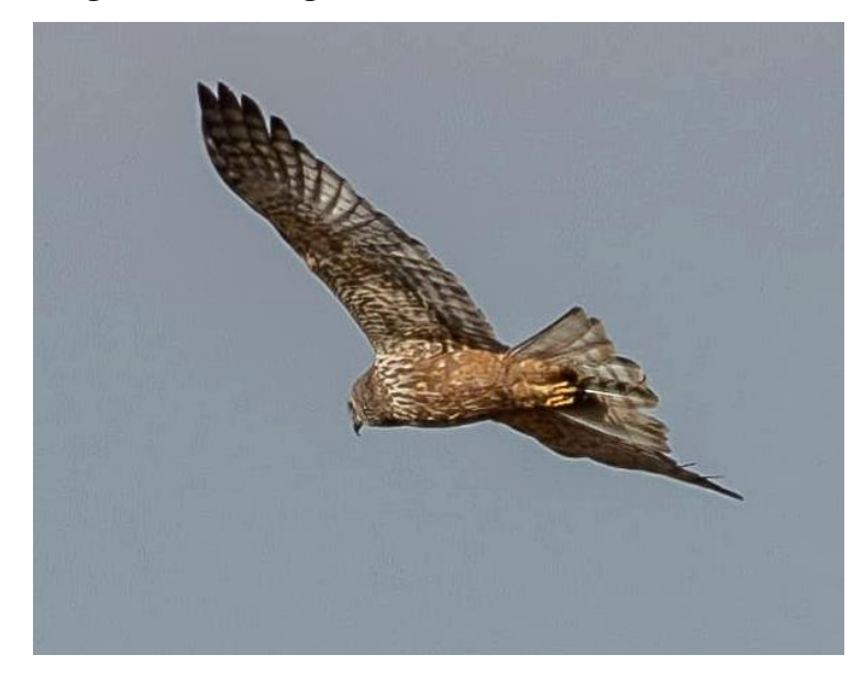
African Marsh Harrier