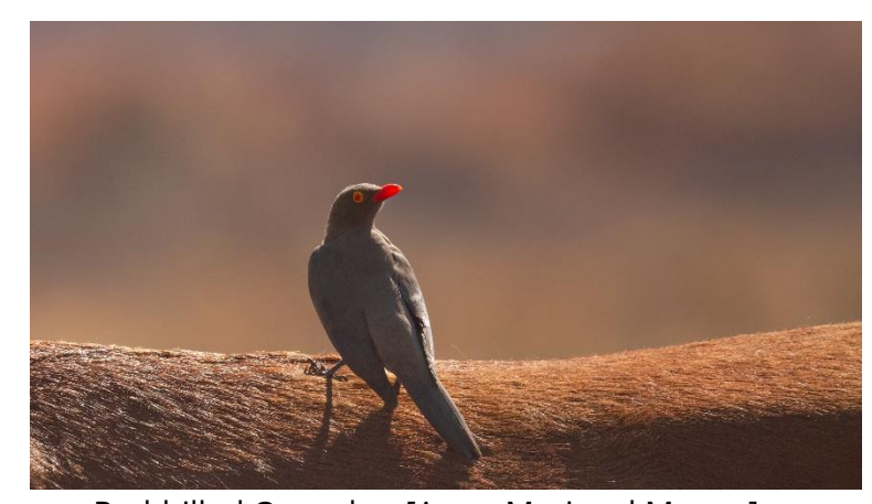
Red-billed Oxpecker [Anne-Marie vd Merwe]