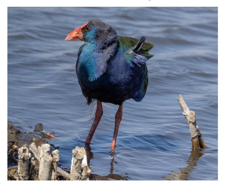
African Swamphen [Hannes van den Berg]

With migrants returning from the northern hemisphere, Marievale is the place to visit in the hope of bagging a wader still in breeding plumage, or even a lifer. Despite many of the pans still being dry, 72 species were seen, with highlights African Marsh Harrier and even an African Rail on the way out. Hannes van den Berg led the outing.