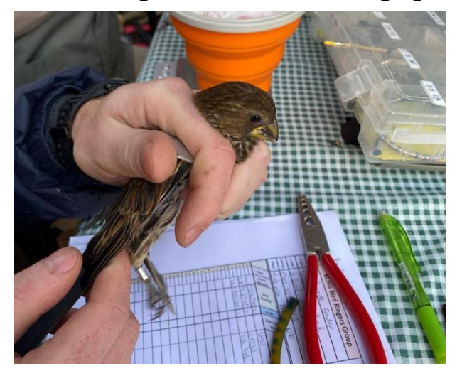
Thick-billed Weaver being measured