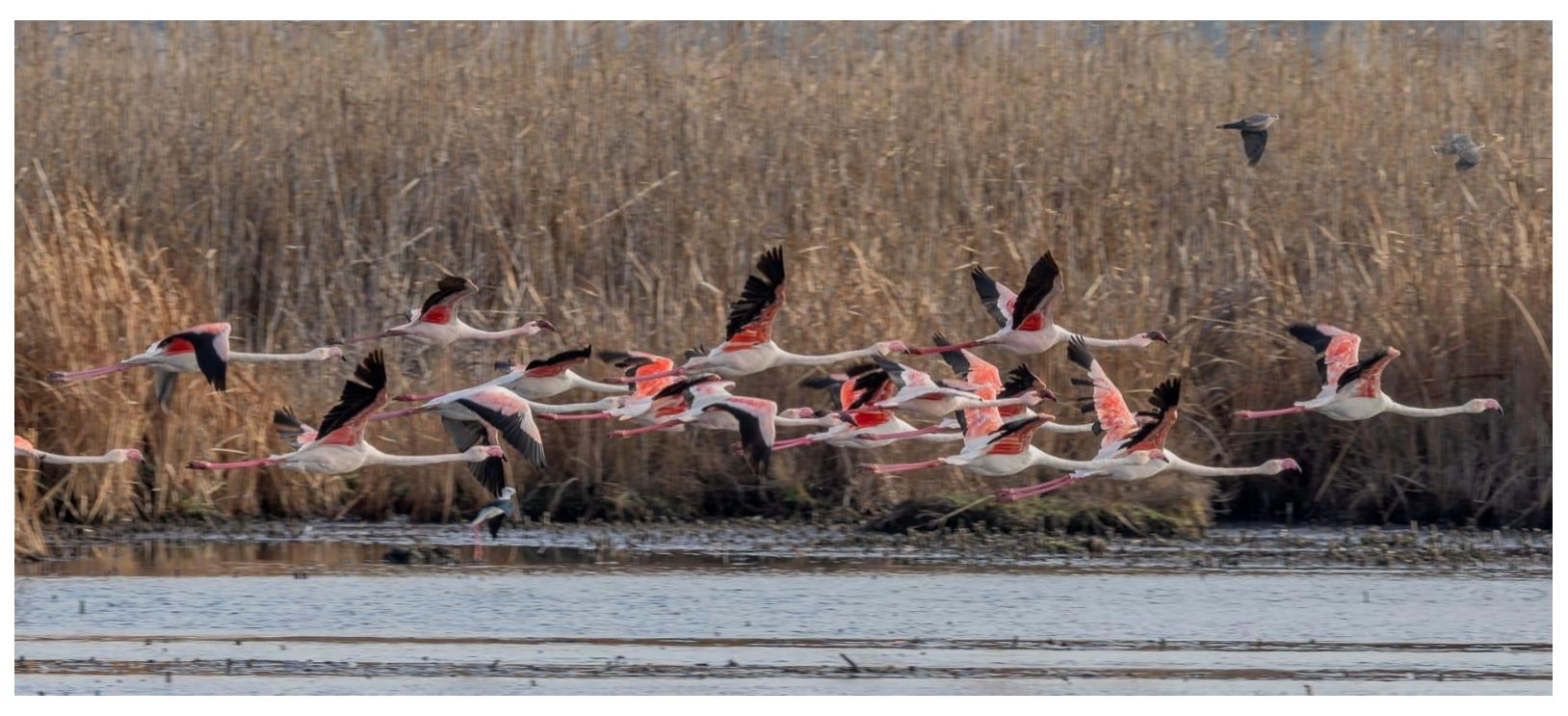
Greater Flamingos with possibly one or more Lesser Flamingos [Hannes van den Berg]