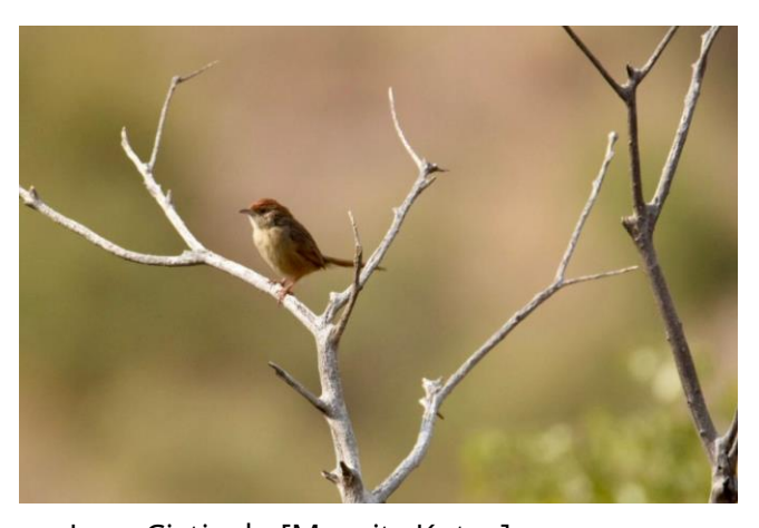
Lazy Cisticola [Mauritz Kotze]