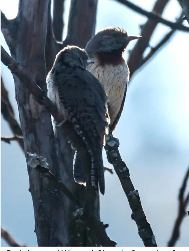
Red-throated Wryneck [Angela Openshaw]