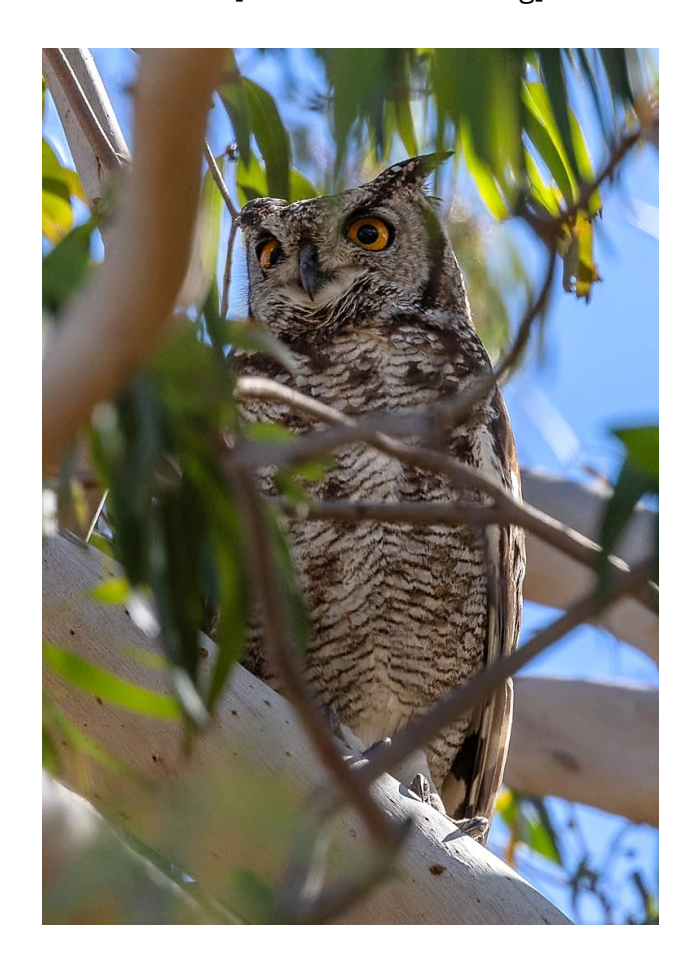
Spotted Eagle-Owl [Hannes van den Berg]