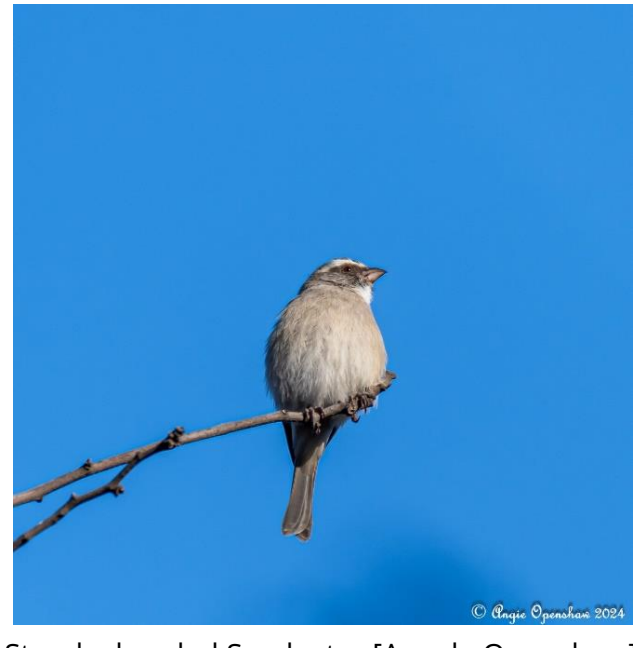
Streaky-headed Seedeater [Angela Openshaw]