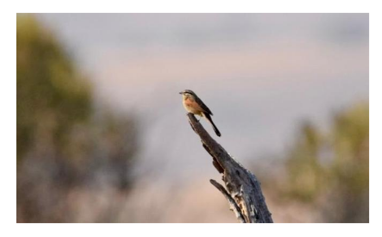
Cape Bunting [Marissa Wolhuter]