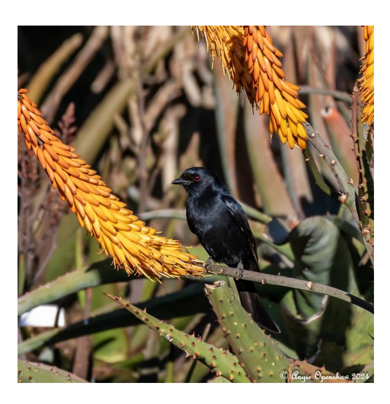
Fork-tailed Drongo [Angela Openshaw]