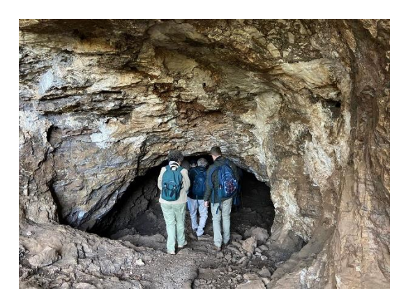
Looking for the resident Western Barn Owl