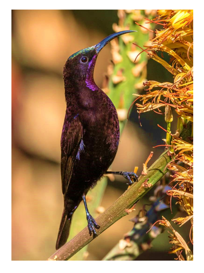
Amethyst Sunbird [Hannes van den Berg]