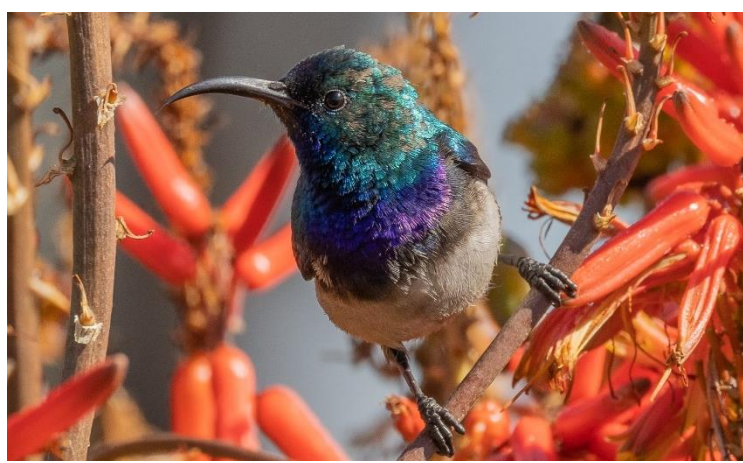
White-bellied Sunbird [Hannes van den Berg]