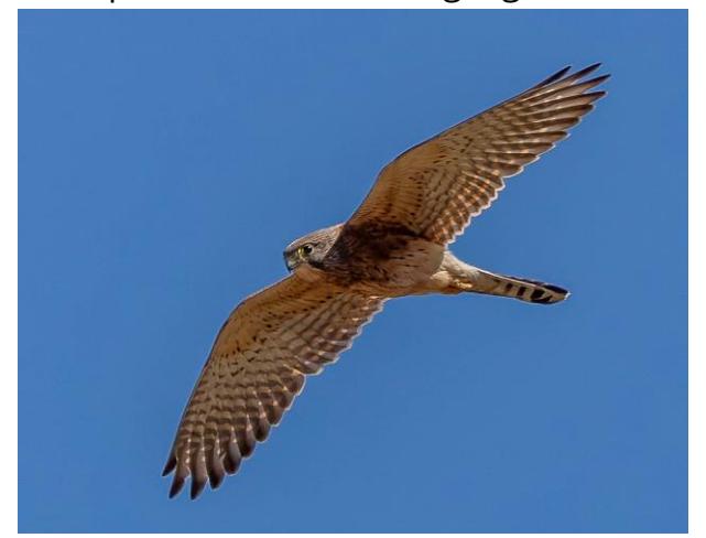
Rock Kestrel