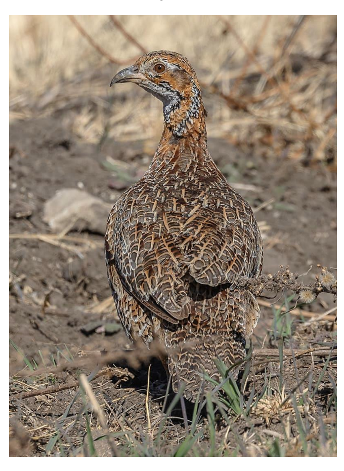
Orange River Francolin [Hannes van den Berg]