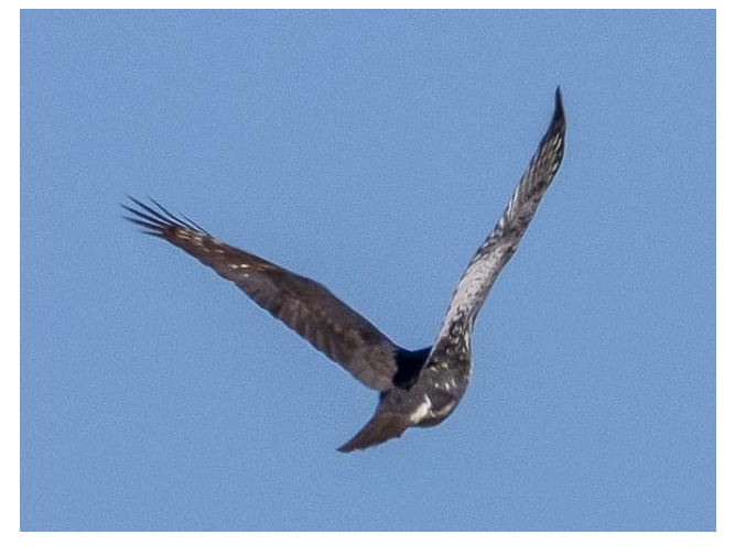
Black Sparrowhawk [Hannes van den Berg]