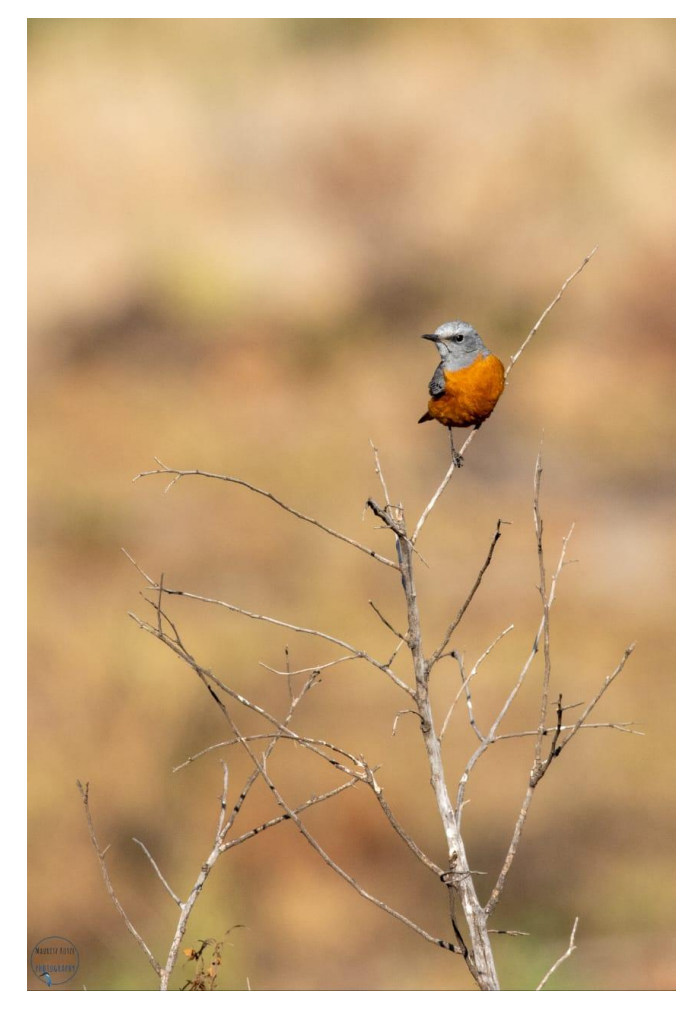
One of the targeted specials, Short-toed Rock Thrush, understood the assignment and posed for excellent views. [Mauritz Kotze]